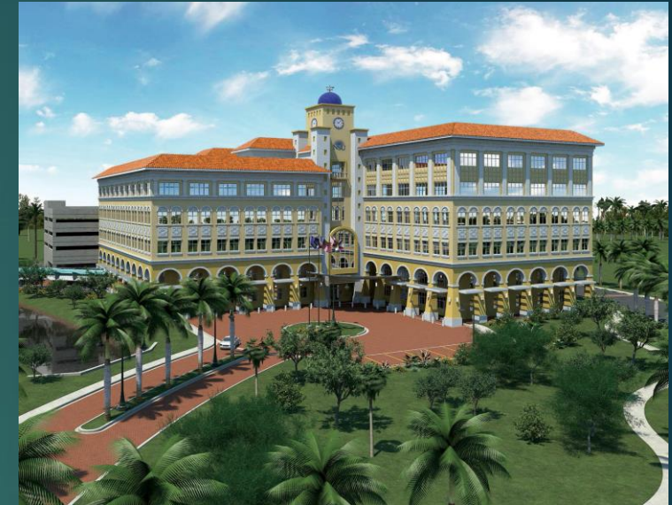
Center for Collaborative Research